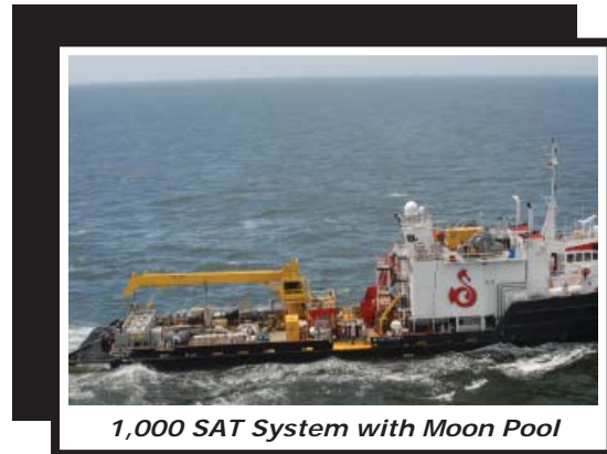
1,000 SAT System with Moon Pool